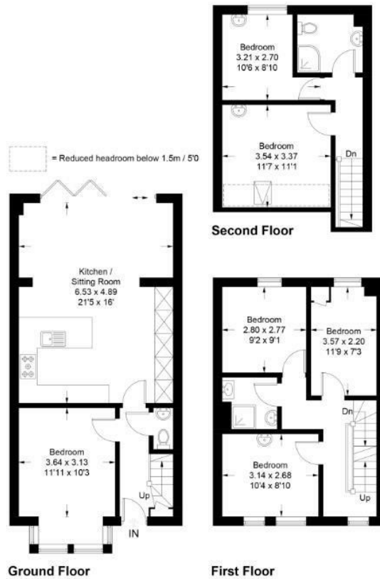
Illustration for identification purposes only, measurements are approximate, not to scale. Imageplansurveys @ 2023